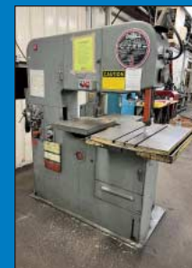
36" DoAll Vertical Bandsaw