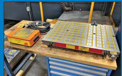
(13) Electromagnetic Chucks