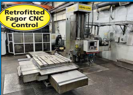
5" G&L CNC Horizontal Boring Mill