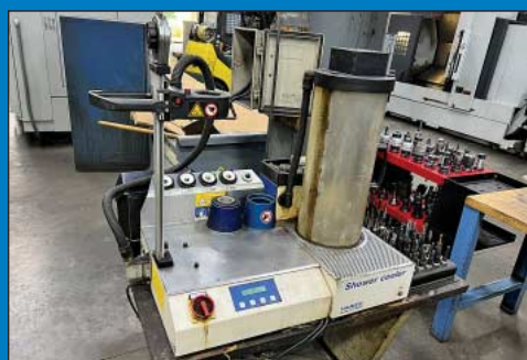
Heat Shrink Machine w/ Shower & Cooler