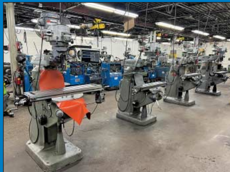
(13) 2 HP Bridgeport Vertical Mills w/ DRO ((6) Black Label)