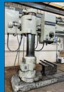
5' Arm X 13" Col. American Radial Arm Drill

(25) Maple Top Lista Workbenches w/ Tooling Cabinets (20) Lista Tooling Cabinets w/ Tooling Large Quantity of Shop Equipment Including: Two-Door Stronghold Cabinets, Dump Hoppers, Workbenches, Die Carts, Pallet Rack, 5,000 Lb Eriez Lifting Magnet Gansow Model CI71 Electric Walk Behind Floor Scrubber