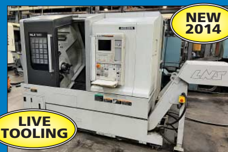
Mori Seiki Model NLX1500MC/500 CNC TC w/ Live Tooling (2014)

(3) Haas EC-500-4AX CNC Horizontal Machining Center