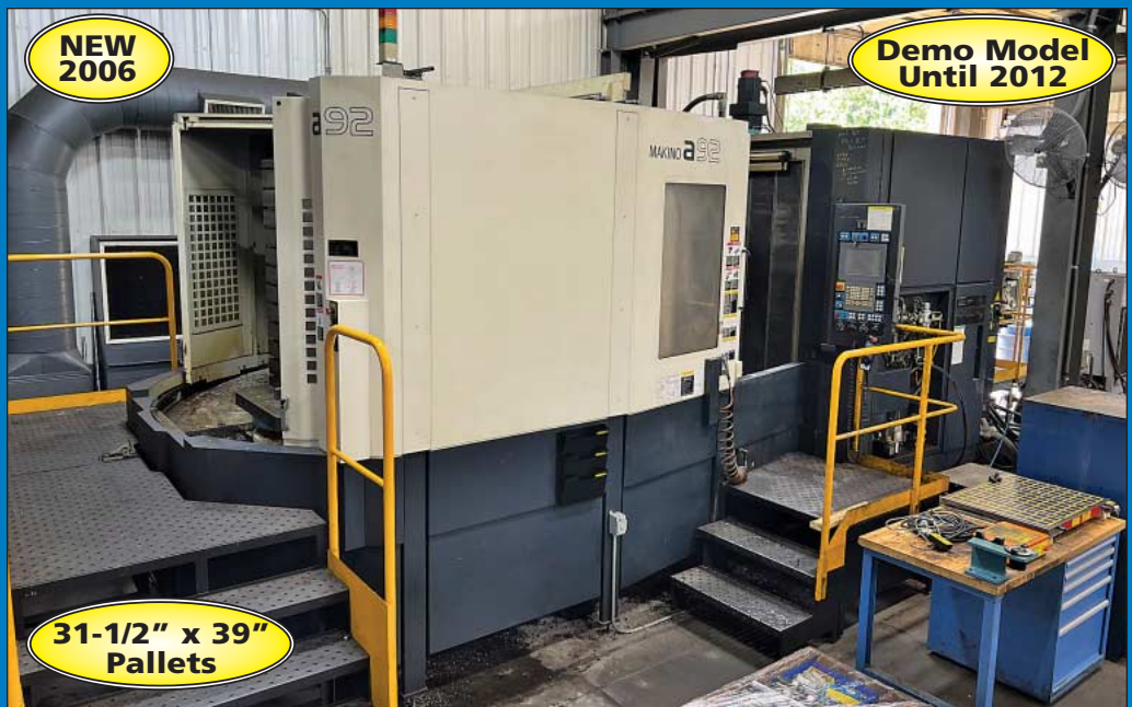
Makino Model A92 CNC HMC (Demo Model Until 2012)

Makino Model A99 CNC Horizontal Machining Center; S/N 99, Professional 3 Control, 31.5" X 31.5" Pallets, 39" X-Axis, 39" Y-Axis, 37" Z-Axis, 50 Taper Spindle, 12,000 RPM, 1-Degree Indexing, 1,000 PSI Thru-Spindle Coolant, 40-Position ATC, 3,900 Lb Max Payload, Chip Conveyor, Rigid Tapping (New 1999)