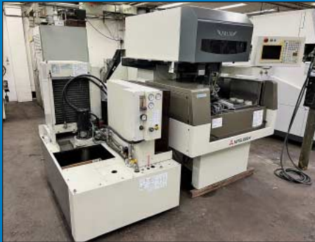
Mitsubishi FA10PM CNC Wire EDM (2002)