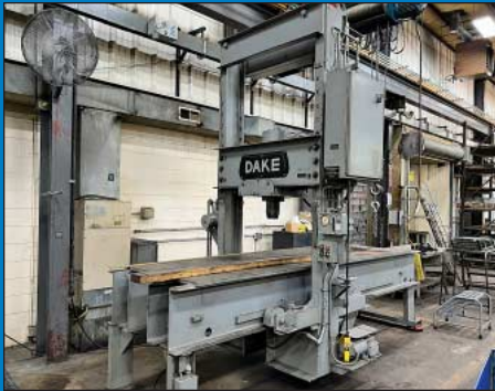
150 Ton Dake Traveling Head Straightening Press w/ 12' Table