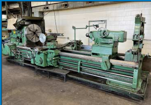
48" X 132" Monarch Lathe w/DRO