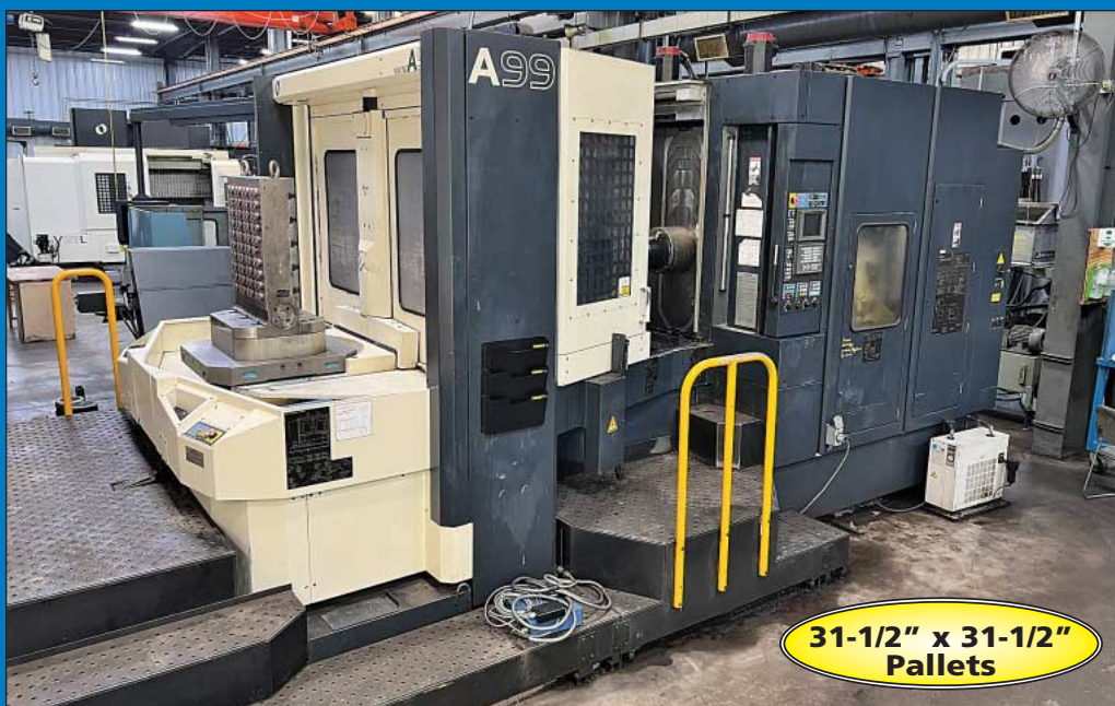
Makino Model A99 CNC HMC

Fadal Model VMC4020HT CNC Vertical Machining Center w/ 8" Fadal Rotary 4th Axis; S/N 012006058916, Fadal CNC 32MP Control, 20" X 40" Table, 40" X-Axis, 20" Y-Axis, 28" Z-Axis, 40 Taper, 21-Position ATC, (New 2006)