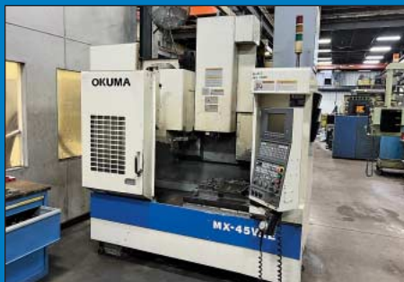
(2) Okuma MX-45VAE CNC VMCs