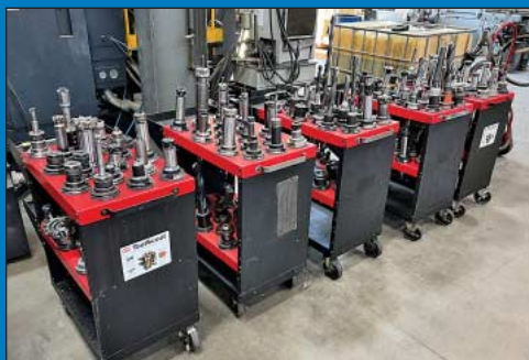
(400+) Toolholders, HSK, 50 & 40 Taper