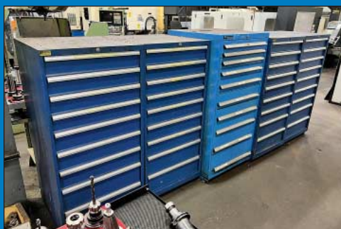
Lista Tooling Cabinets