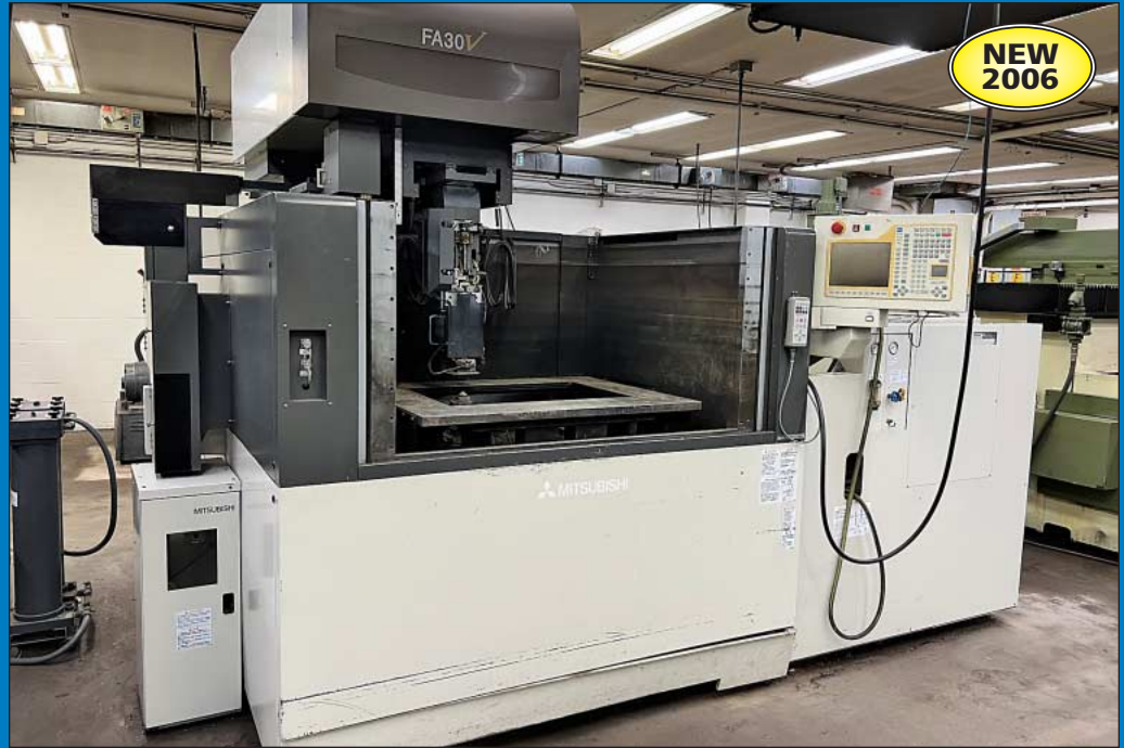
Mitsubishi FA30VM CNC Wire EDM (2006)