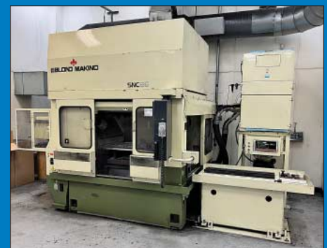
Makino Model SNC86 CNC Graphite VMC