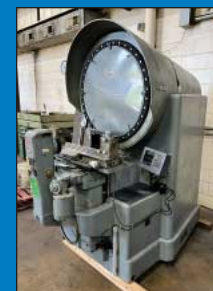
30" Ex-Cello Optical Comparator w/DRO