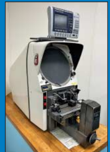
14" Optical Comparator w/ DRO