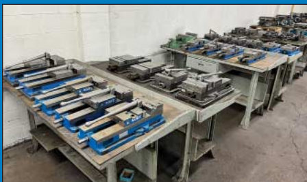
Large Quantity of Machine Accessories