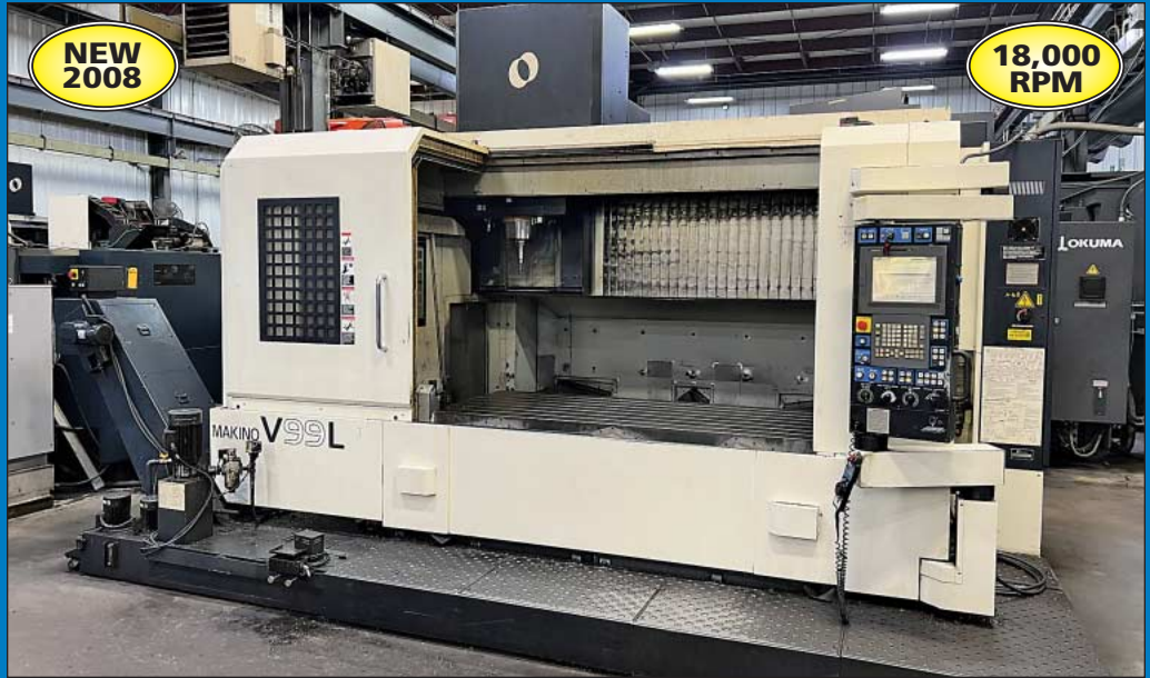
Makino Model V99L CNC VMC(2008)