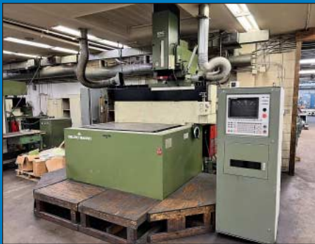
(6) Makino EDNC85W, EDNC85, EDNC65 CNC Die Sinker EDM's