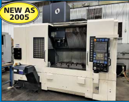
(2) Makino Model V77 CNC VMCs (2004)