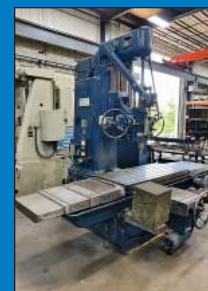
Pratt & Whitney Model 3B Jig Borer w/DRO