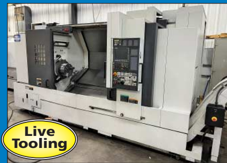
Mori Seiki Model NL3000MC/1250 CNC TC w/ Live Tooling (2005)