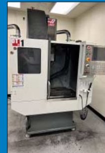
Haas DT-1 CNC Vertical Drill & Tap Center (2014)