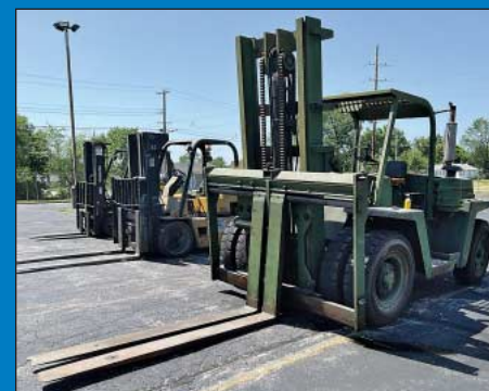
Lift Trucks up to 20,000 Lb Capacity