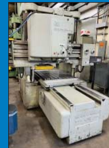
SIP Model HYDR-6A Jig Borer w/DRO