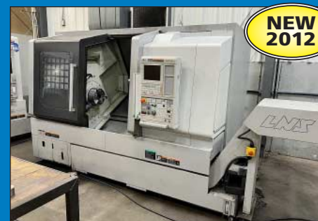
Mori Seiki Model NLX2500Y/700 CNC TC (2012)