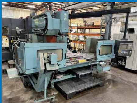
Leblond Makino GN2012 CNC VMC