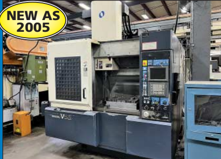
Makino V55 CNC VMC