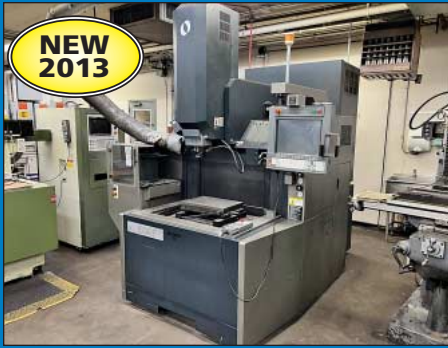
Makino EDAF3 CNC Die Sinker EDM (2013)