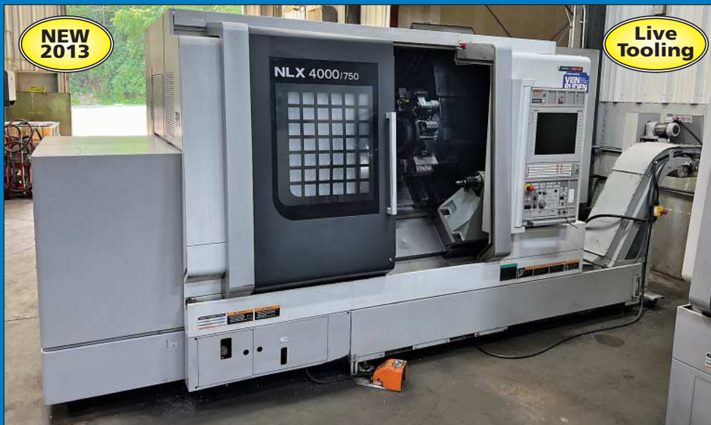
Mori Seiki Model NLX4000BY/750 CNC TC w/ Live Tooling (2013)