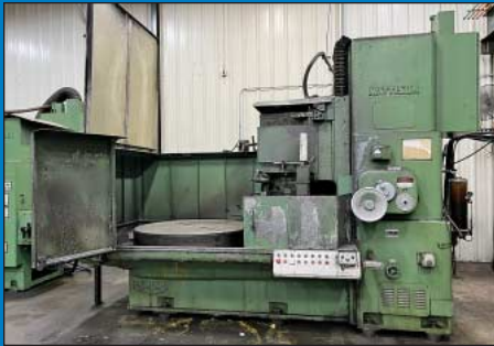
60" Mattison Rotary Surface Grinder