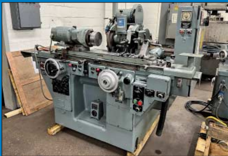
10" X 20" Brown & Sharpe 1020U Cylindrical Grinder