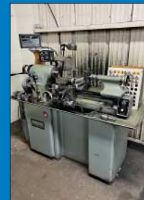
Hardinge HLV-H Lathe w/DRO