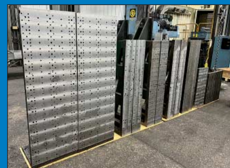
Large Quantity of Angle Plates Including up to 48" X 48"