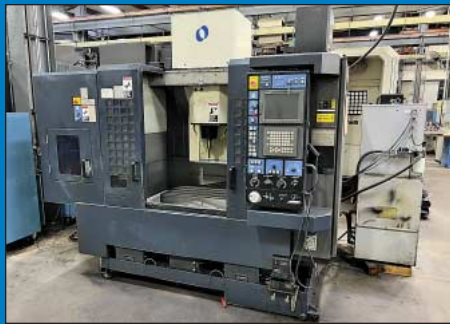
Makino V33 CNC VMC