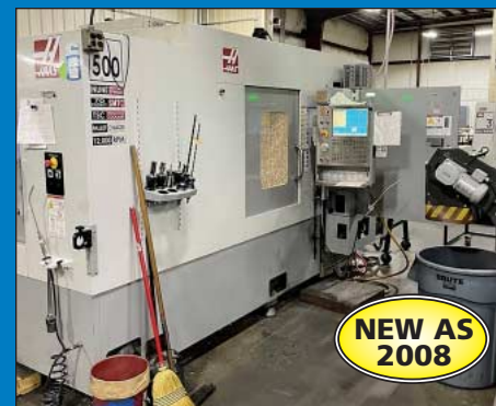
**3) Haas EC-500-4AX CNC Horizontal Machining Center w/ Full 4th **Located Offsite**