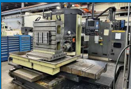
4" Kuraki Model KBT-10DX-A CNC Table Type Horizontal Boring Mill